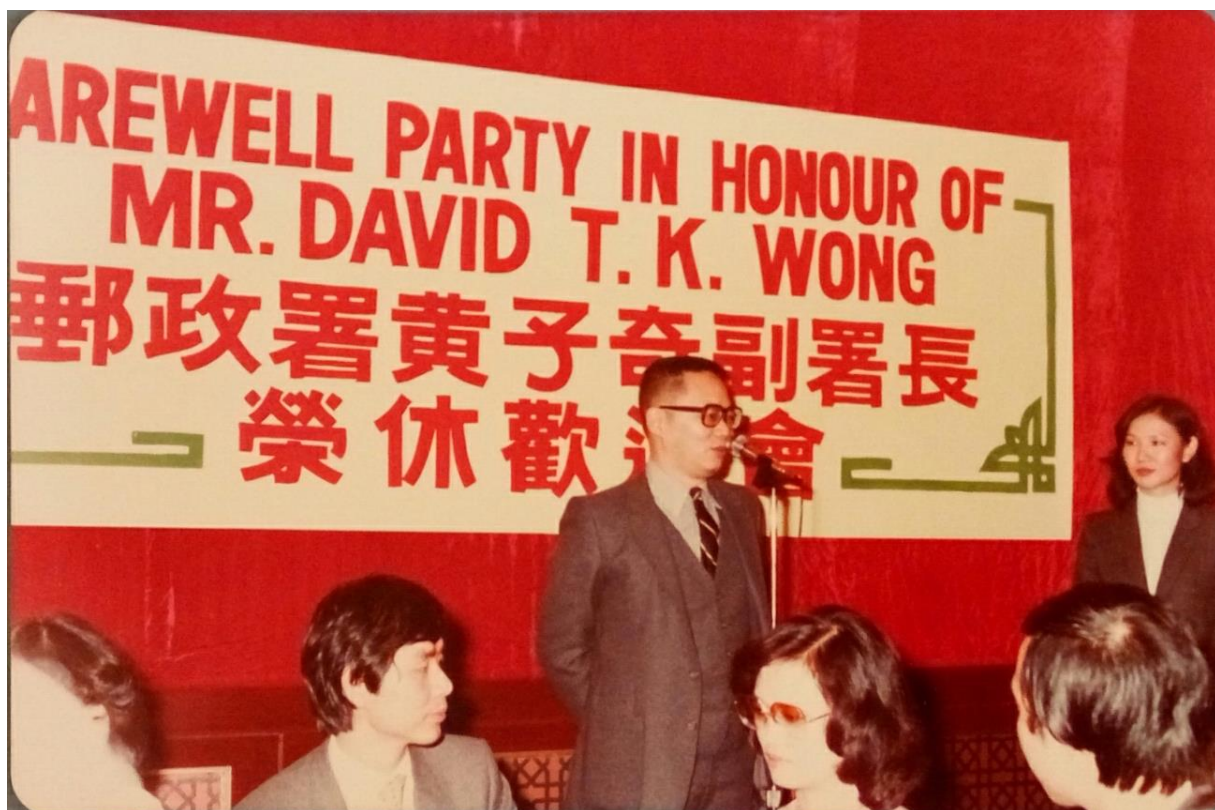
Author giving thanks to Post Office staff at the farewell dinner